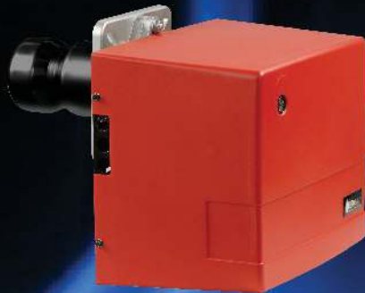
Light Oil Burners