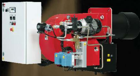
Dual Full Burners