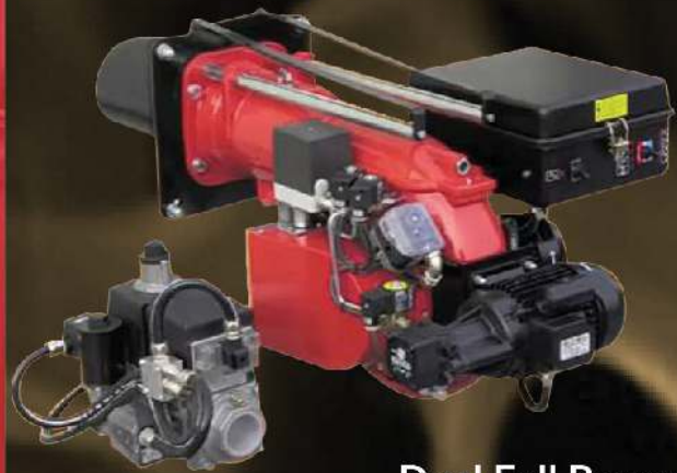
Dual Full Burners