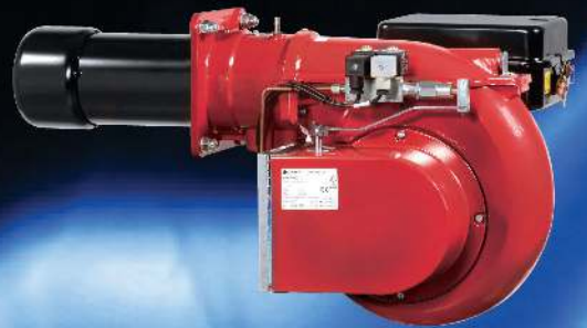
Light Oil Burners