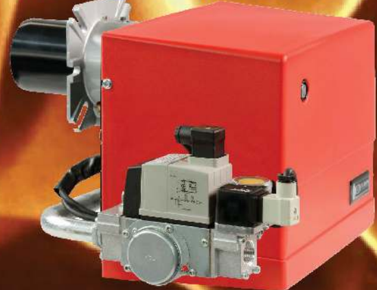
LPG & Gas Burners