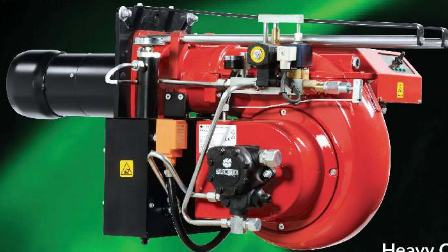
Heavy Oil Burners