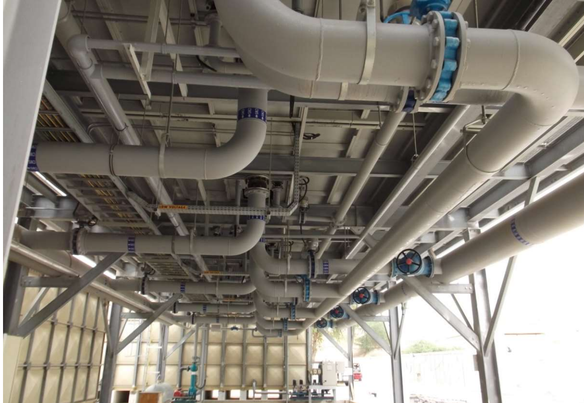
HVAC - Piping