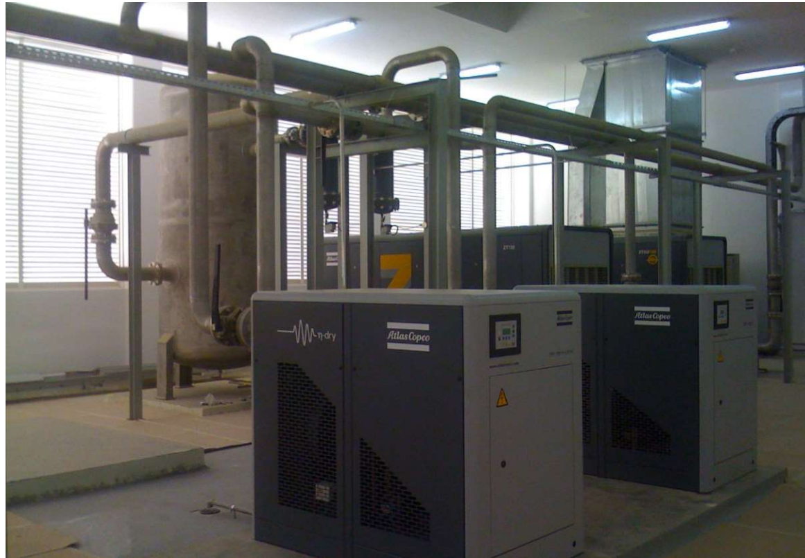
Compressor room piping