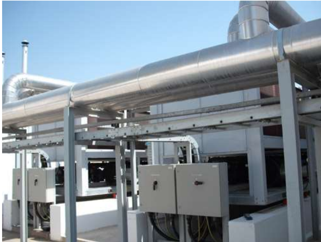
HVAC – Chiller yard