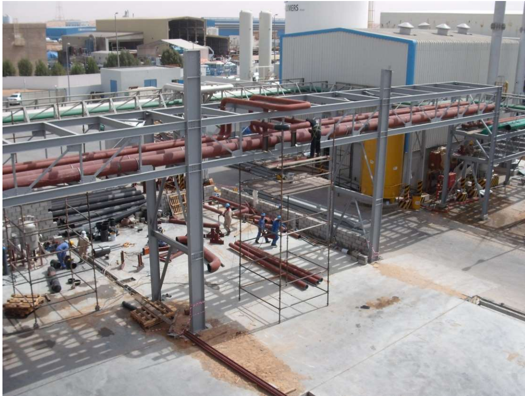
Black Utility Piping