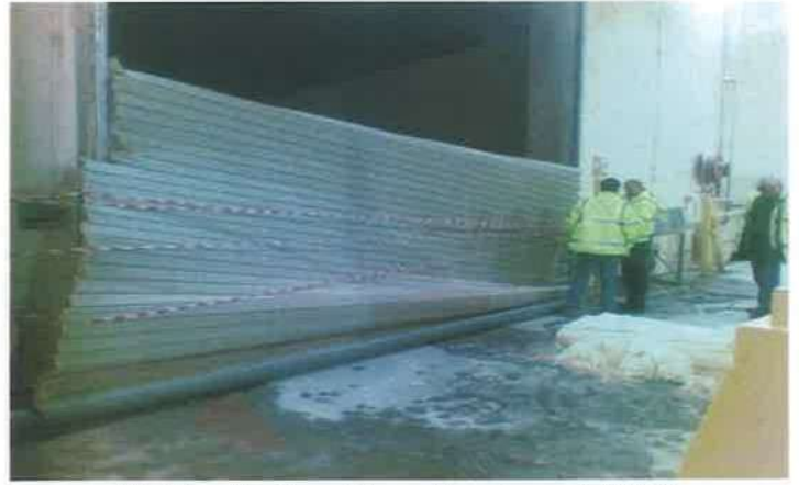
Rolling Shutters Doors Repairs and AMC