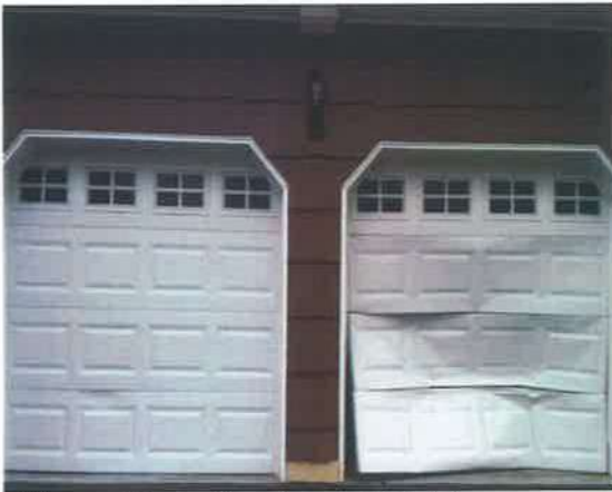
Garage Doors Repairs and AMC