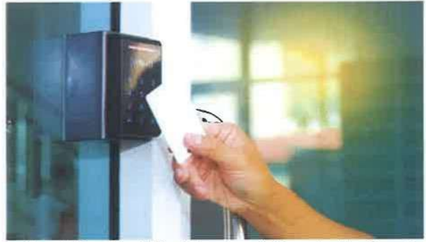
Card Reader Machines and Proximity Cards