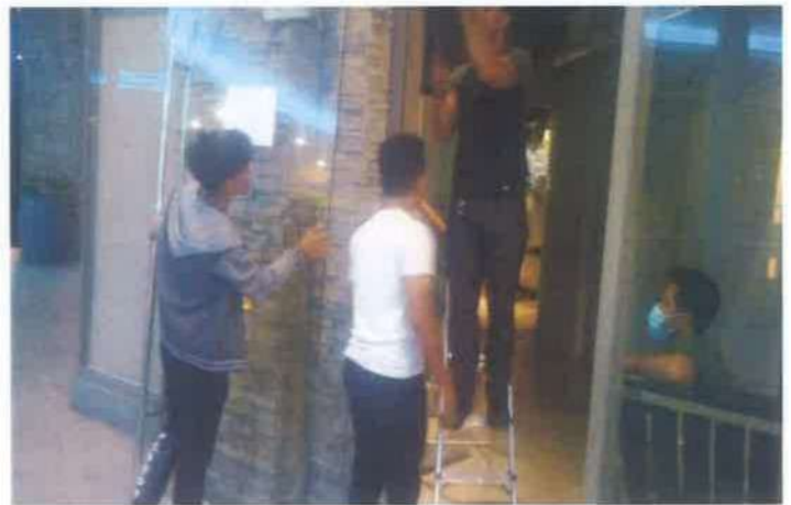
Automatic and Manual Glass Doors Repairs and AMC