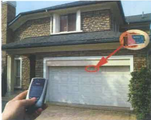
GSM Mobile Phone Network Opening