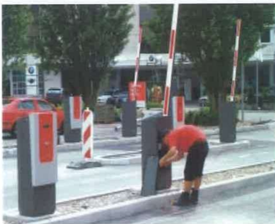
Automatic Traffic Barriers Repairs and AMC