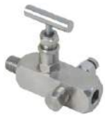
Double Block & Bleed