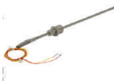
Thermocouple Transition Joint