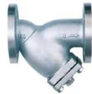
Y-type Strainers / Basket Strainers