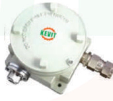
Explosion/ Flame Proof Pressure Switches