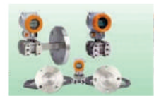
Capillary/Direct Flanges Type DP/Level/Flow Transmitter