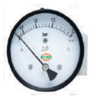
Piston Type DP Gauge DIAL SIZE: 63/100/150MM