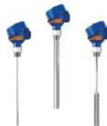
Guided Wave Radar Wired/Rigid Rod