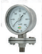
Low Pressure Vacuum Pressure Gauges DIAL SIZE: 63/100/150MM