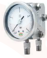
DP Gauges Single / Double Diaphragm Type DIAL SIZE:100/150MM