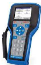
475 HART Calibrator