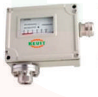
Weather Proof Pressure Switches