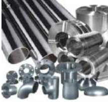
Pipe, Flanges & Pipe Fittings