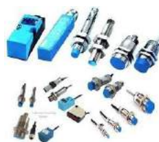
Proximity & Photoelectric Sensors