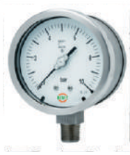
Solid Front Pressure Gauges DIAL SIZE : 100/150MM