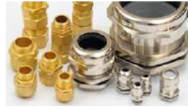
Switchgear Products & Cable Glands