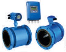
Electromagnetic -inline / Battery Operated