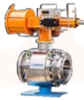
Emergency Shut Down Valve