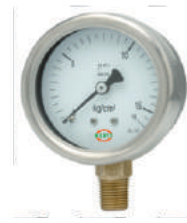
SS Case Brass Pressure Gauge SIZE: 50/63/100MM