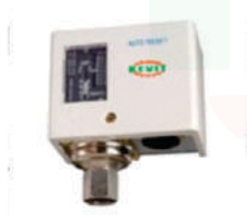
Utility Pressure Switches