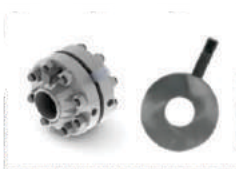
Orifice Plate & Flange Assembly