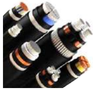
Electrical Power Cables