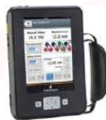
Emerson TREX/ HART Calibrators