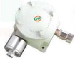
Explosion/ Flame Proof Differential Pressure Switches