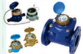
Mechanical water meters