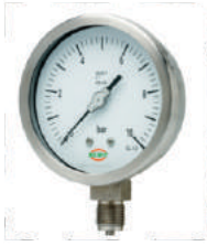
Full SS Pressure Gauges DIAL SIZE : 50/63/100/150/250MM