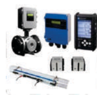
Ultrasonic Clamp On