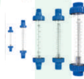
Threaded/union Type Plastic