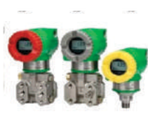
Smart Absolute/Gauge Pressure Transmitters