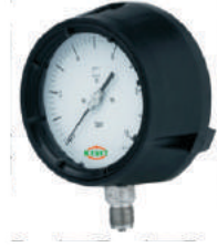
Phenol Case Solid Front Pressure Gauge DIAL SIZE: 125MM