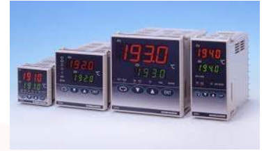
Digital Indicators & Controllers