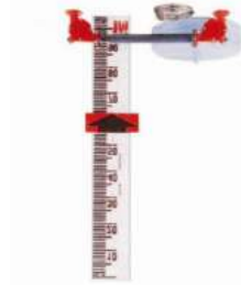
Float & Board