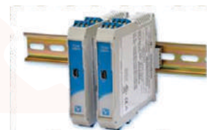
DIN Rail Mounted