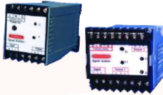
Automation Products - Signal Convertors, Electrical Transducer, Isolators. etc