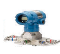
Capillary/Direct Flanges Type DP/Level/Flow Transmitter