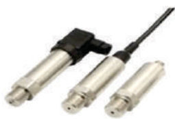
Miniature/Fixed Range Type-Flush Type/Diaphragm Type