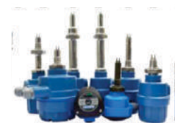
Thermal Dispersion Kits