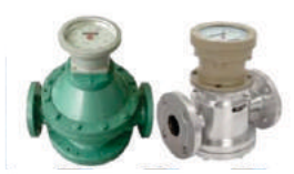
Positive Displacement (PD)