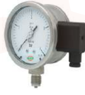
Pressure Gauge With Transmitter Output DIAL SIZE:100/150MM