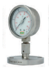
Diaphragm Seal Pressure Gauges DIAL SIZE: 63/100/150MM