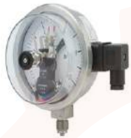
Electric Contact Full SS Pressure Gauge DIAL SIZE:100/150MM