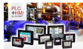
PLC / HMI / SCADA